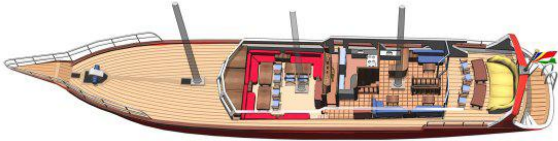
Main Deck – Sun Deck, Back Deck, Dining Salon, Lounge/Salon