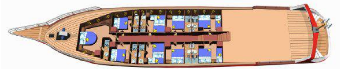
Lower Deck – Cabin Accommodation