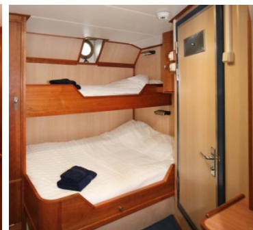
Twin Private Porthole Cabin