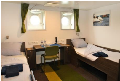
Twin Porthole Cabin