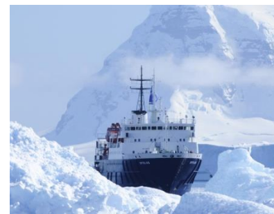
Ortelius in Ice