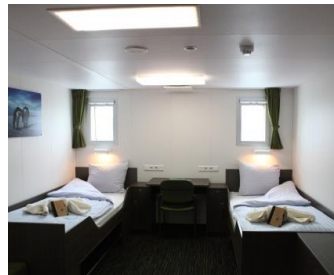
Twin Window Cabin