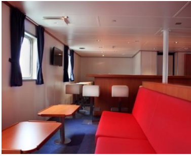
Bar & Observation Lounge