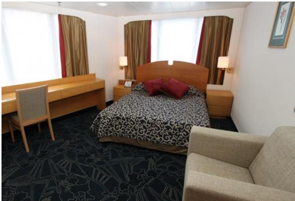
Top Deck Double