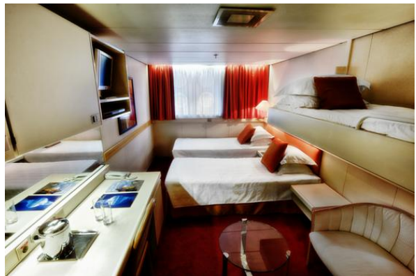
Triple Porthole Cabin