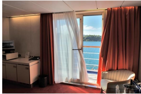
Ocean Diamond Suite