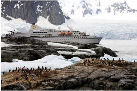
View from Zodiac Cruise