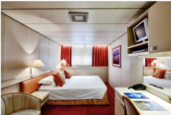
Single Porthole Cabin