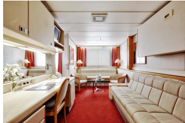
Suite Living Room