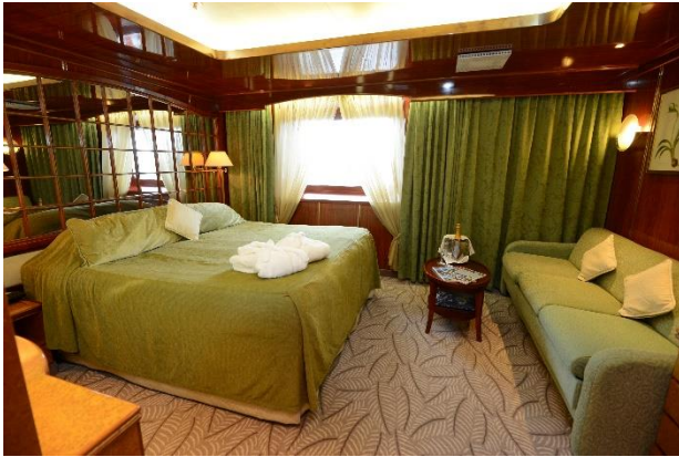
Double Promenade Suite