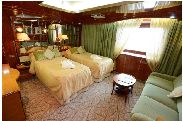
Twin Promenade Suite